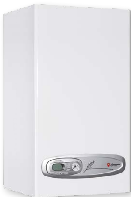
MOD C: OPEN FLUE MOD F: ROOM SEALED