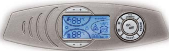
Panel for ERA F D range